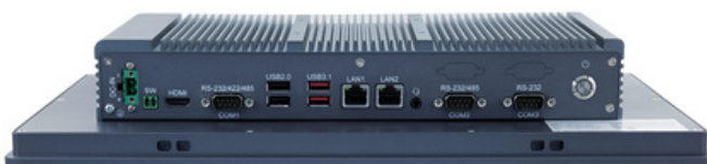
ASLAN II 15.6" & 21.5"