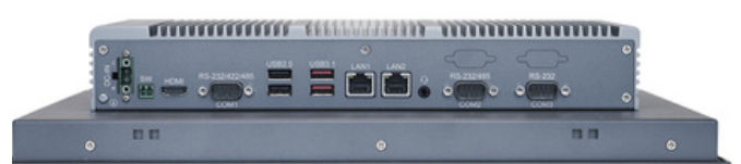
ASLAN II 18.5"